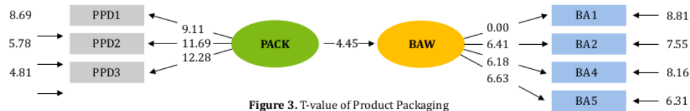
Figure 3. T-value of Product Packaging

Chi-Square=32.86, df=13, p-value=0.00179, RMSEA=0.085