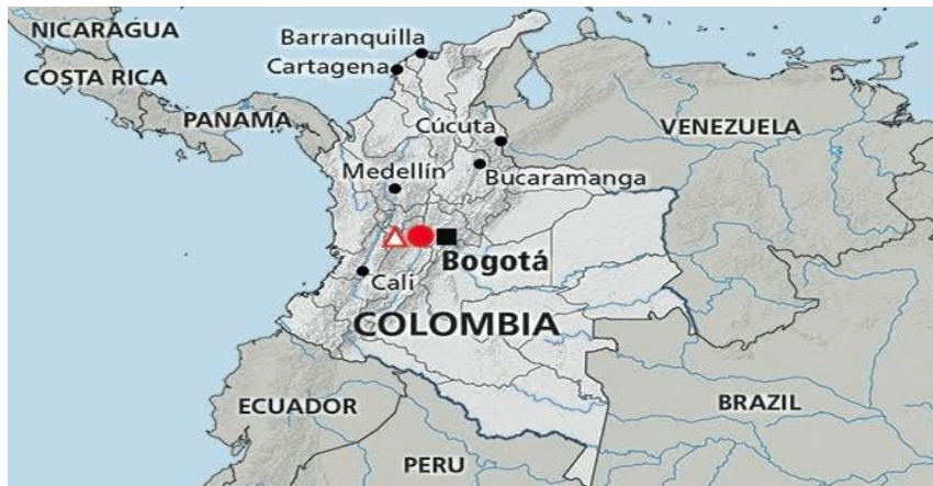
Figure 1: Geography Map of Colombia