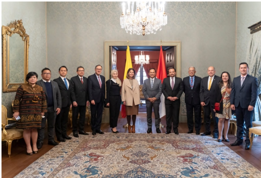
Figure 2: The 2nd Political Consultation Forum between the Government of Indonesia and the Government of Colombia took place in Bogota, Colombia (24/05/2022).