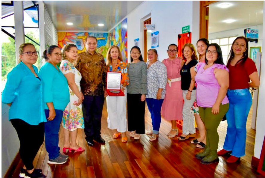
Figure 3: Efforts to Strengthen Indonesia-Colombia Economic Cooperation, Indonesian Ambassador to Bogota Meets several Colombian Business Associations, 11/04/23