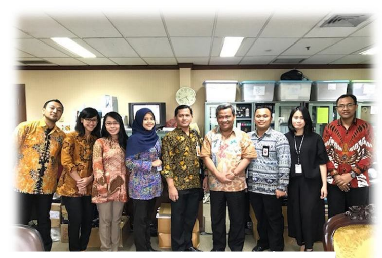
Pict 2: Together with the on-site supervisor and the head of bureau of Leadership Secretariat of MPR