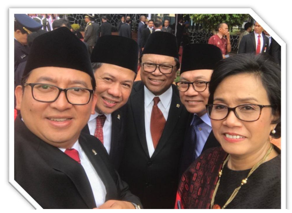
Selfie Time: the chairman of the People's Consultative Assembly and the head of chairman of the House of Representative and Minister of Finance after the Ceremony.