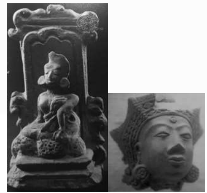
Soedarmadji Collection/AD 0044 - Rijksmuseum-4195/18

The people in the Majapahit palace, coded by the accessories, hair style, and clothes they wear, unfortunately doesn't have a proper comparison from the richness of ceramic findings in Trowulan, the former capital, except for the royal lady. A further observation of the pillars, gate, house, curtain, wall, incent, porcelain, plants, ear stud, etc., can functioned to reveal the distance between myth and the historical terracotta representations of the same objects.