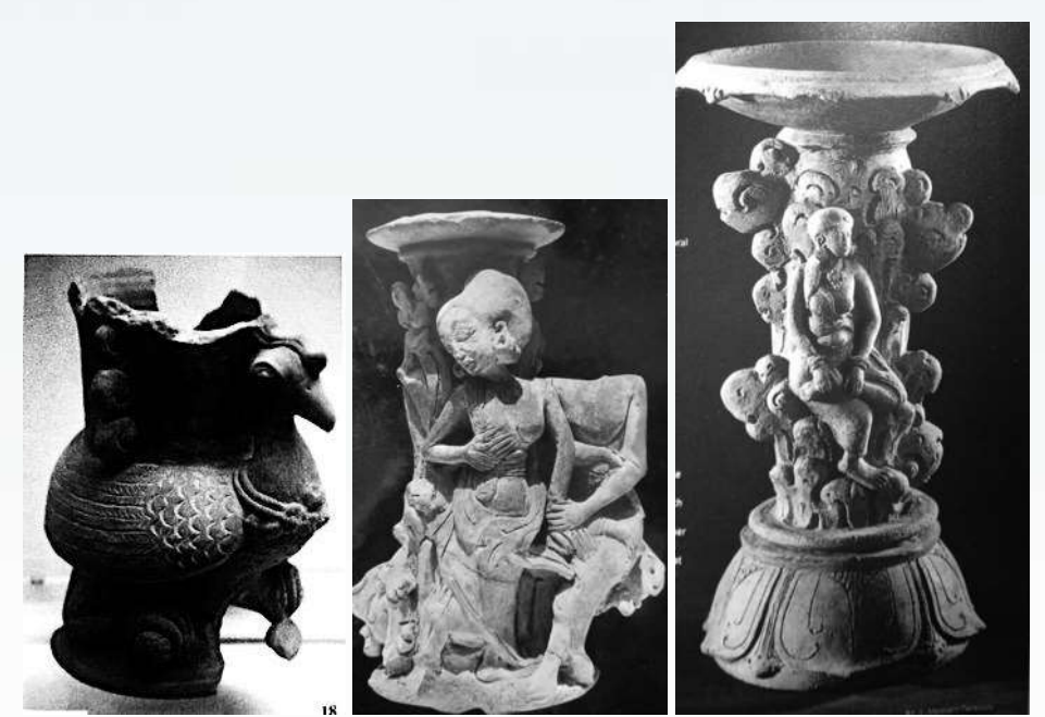
Rijksmuseum Amsterdam / MAK 1904 - Soedarmadji / AD 0060 - AD 0027

the former Majapahit capital city, and the rich man clothes seems like the outfit from 20<sup>th</sup> century in Central Java. The rich man offered them delicious food as an act kindness.