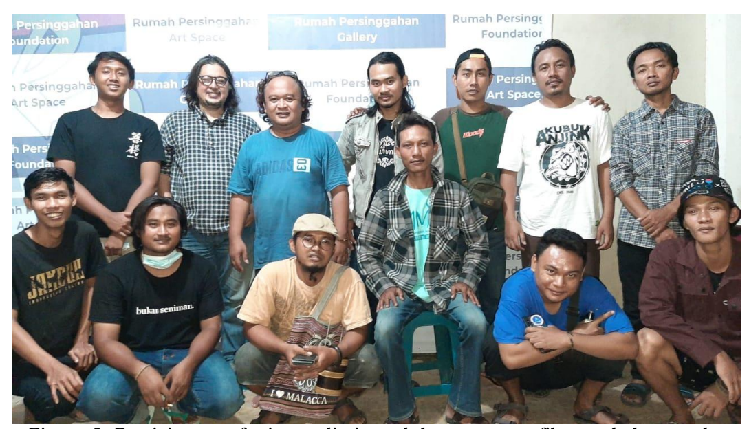
Figure 3. Participants of a journalistic and documentary film workshop at the Tuban transit house