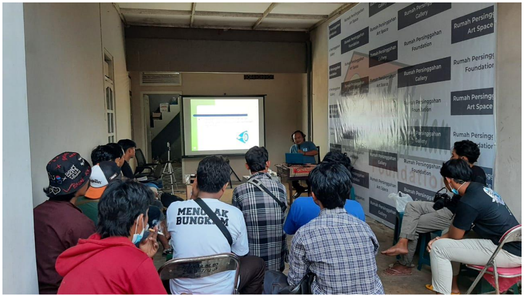
Figure 2. A Workshop with an arts and culture literacy community at the Tuban transit house

The Saung Arma Community, Street Library, Sibolang (Palang Youth Literacy), Lantern Community, Bahari Library, and Transit House are communities of arts and culture activists consisting of young people who have a high fighting spirit in re-discovering the value of local wisdom which has almost disappeared from the collective memory of the Tuban community. These communities have high enthusiasm in carrying out activities to educate the community in various ways. There is one that goes to the streets, such as the Street Library, which provides educational discourse through books. Likewise, other communities follow their own paths for the good and progress of Tuban. It is an effort that we should imitate and be an inspiration for us to do good by using science.