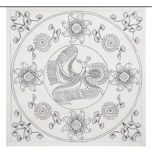
Table 2 Batik work