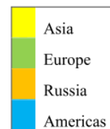
Figure 3. GDP shift overtime (Bucholz, 2020)