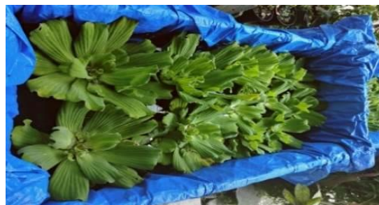
Figure 1. Reactor for Acclimatization Process

The tools needed were 1 L beaker glass, 30 mL volumetric pipette, glass rod, 1 big reactor with dimension 100 m x 80 m for acclimatization process, and 12 reactor basins for the treatments.