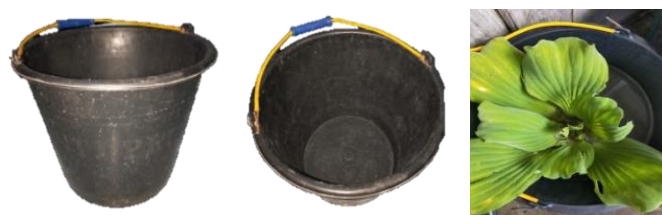
Figure 2. Batch Reactor for Experiments