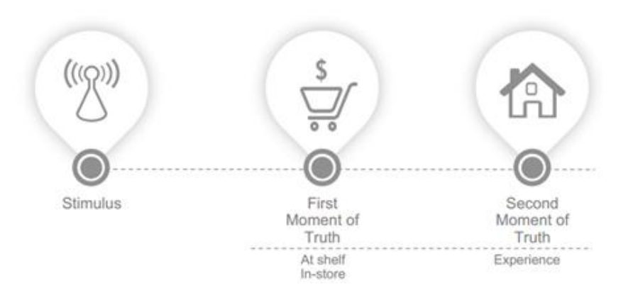
Figure 1.1 Traditional Mental Model of Marketing