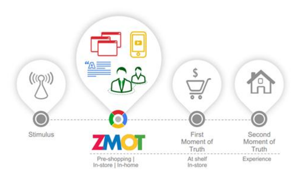
Figure 2.4 New Mental Model of Marketing

Consumers have many choices that they have ever had before as well as they use them to look for information about the companies, their product or services. They trusted third party sources to check the credibility of the company's as well as the consistency (Augustini, 2014).