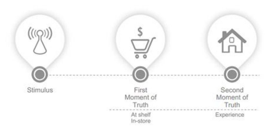
Figure 2.3 Traditional 3-Steps Mental Model of Marketing