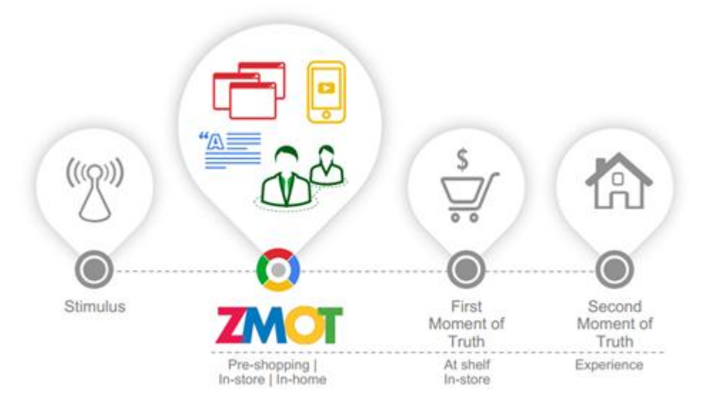
Figure 1.2 New Mental Model of Marketing