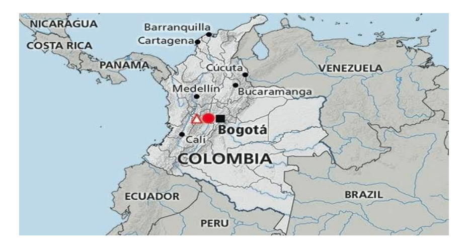
Figure 1: Geography Map of Colombia