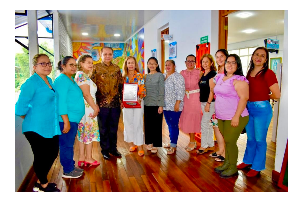
Figure 3: Efforts to Strengthen Indonesia-Colombia Economic Cooperation, Indonesian Ambassador to Bogota Meets several Colombian Business Associations, 11/04/23