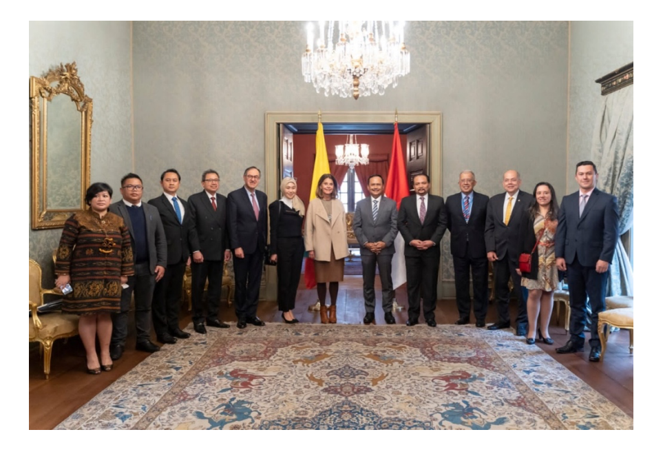
Figure 2: The 2nd Political Consultation Forum between the Government of Indonesia and the Government of Colombia took place in Bogota, Colombia (24/05/2022).