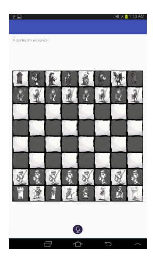
Figure 34 Game Screen

From the result above, factors that can influence probability of success rate in recognizing input are two important factor, which are noise and the surrounding environment. Based on the result, probabilities will be divide into three section based on certain value, which are: