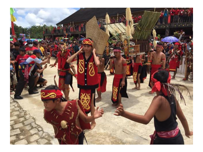
Figure 2. Naik Dango post-harvest ritual's after Nyangahatn

At the preparatory stage, the Nyangahatn ritual is usually carried out at each cycle of rice cultivation, either at the time of planting or post-harvesting (annually). This ritual is performed as a form of gratitude to Jubuta (the Divine) for the harvest's success or the failure of the harvest. The Nyangahatn ritual will usually be closed with another more simple that is the Naik Dango ritual. The ritual implementation will be led by a unique traditional officer who handles rice by Tuha Tahutn . The ritual can be done near the rice fields or at home. In principle, the implementation of the Nyangahatn ritual either by means of Nyangahatn Manta' (without the sacrificial animal or the sacrificial animal has not been slaughtered) or Nyangahatn Masak' (the sacrificial animal has been slaughtered) is the same. The implementation process of both is filled with three activities, namely Matik (intent prayer), Ngalantekatn (salvation prayer), and Mibis (prayer for all to reach their goal).