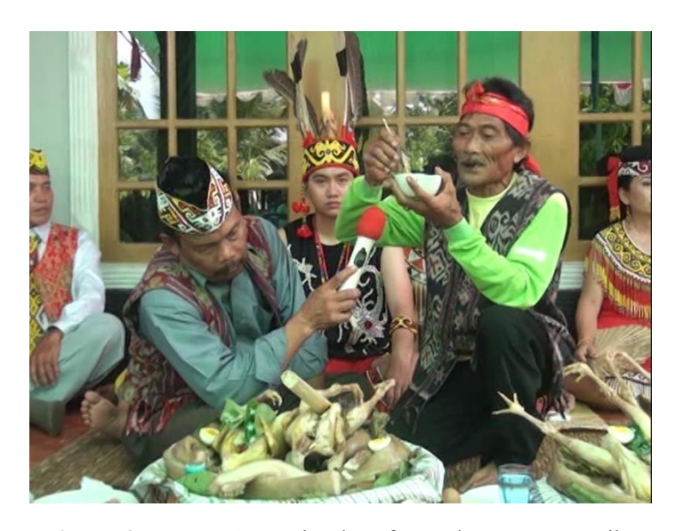
Figure 3. Nyangahatn Ritual's of Dayak Kanayatn Tribe

This prayer aims that everything that has been asked of Jubata be granted. After the Mibis prayer, the chicken is slaughtered, and its blood is drawn as a symbol of sacrifice. The chicken is cleaned by removing only the intestines. Then the chicken is grilled or boiled to be eaten together. After reading the prayer, the residents will start cutting trees and grass in their paddy-rice fields. This activity is carried out by the family itself or in a balale' (cooperation). After the paddy-rice fields are considered ready to be planted, residents will start planting and hope that the crops will be good and produce a satisfactory harvest. The Nyangahatn ritual will be held again by residents at harvest time as a form of gratitude. Usually, this ritual is carried out festively and is known as Makatn Nasi'Barahu (eating freshly harvested rice) ( Ibid. , pp. 37-42).