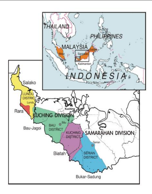
Figure 1. The dispersion of Dayak Bidayuh at the Border of Indonesia-Malaysia (Sarawak)