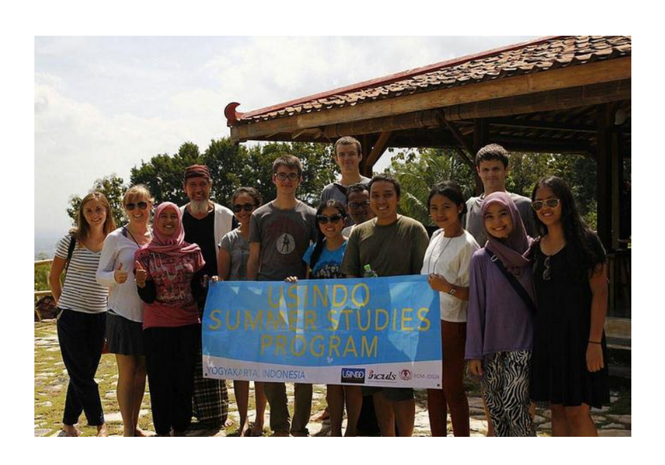
USINDO Summer Studies 2015