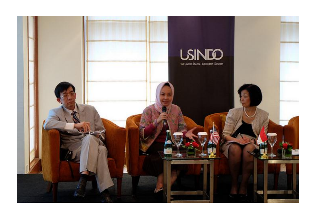
USINDO Open Forum on Advancing STEM Development In the U.S. and Indonesia