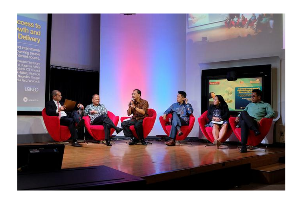
USINDO Open Forum on Expanding Internet Access to Support Economic Growth and Government Service Delivery