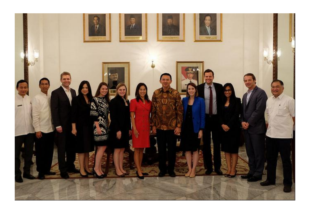
USINDO – ACYPL American Delegates Visit to Indonesia