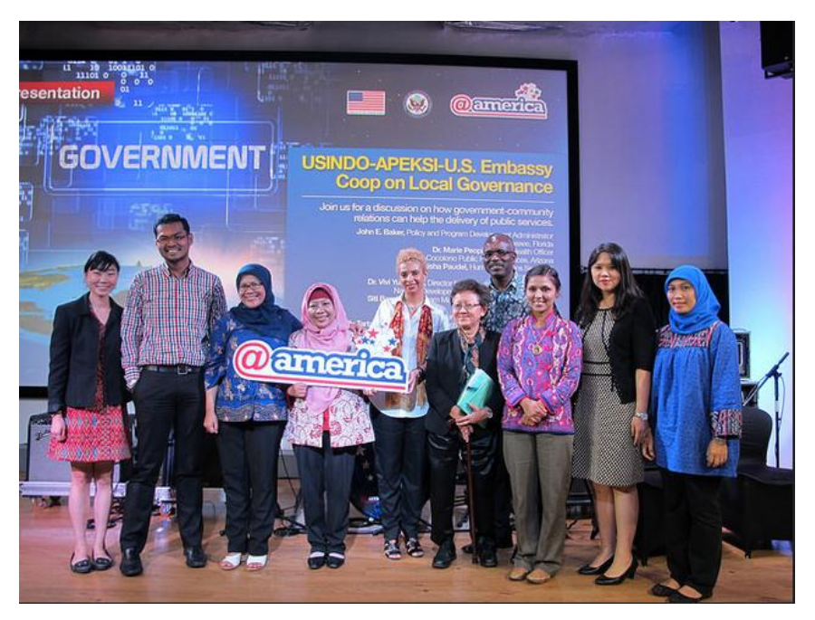
USINDO Open Forum on Government and Community Relations in Public Service Delivery