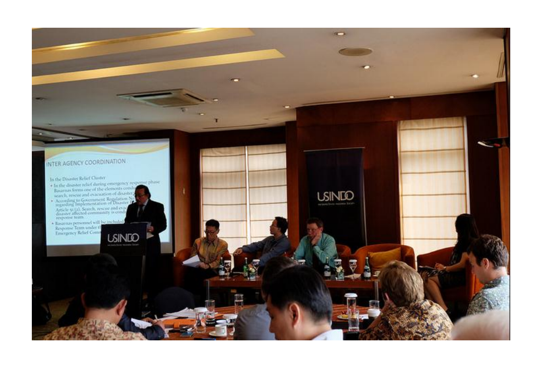
USINDO Open Forum on Disaster Preparedness and Response In the U.S. and Indonesia