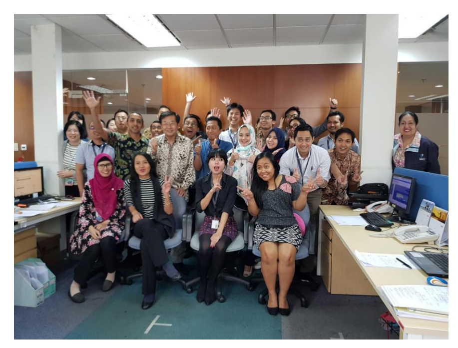
Figure 3. 2 Visitation President Chief Officer