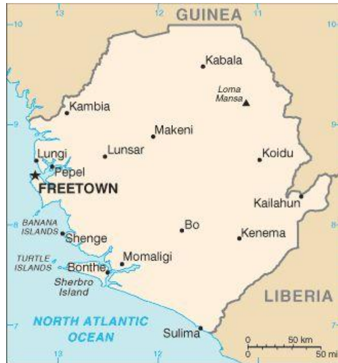
Picture 1.2.1, Maps of Sierra Leone: http://www.state.gov/p/af/ci/sl/

Citizens Sierra Leone divided by 18 ethnic groups. Mende and Temme are the two largest tribes in it. Krio people, who are the descendants of African slaves who had been liberated, generally living in Freetown.